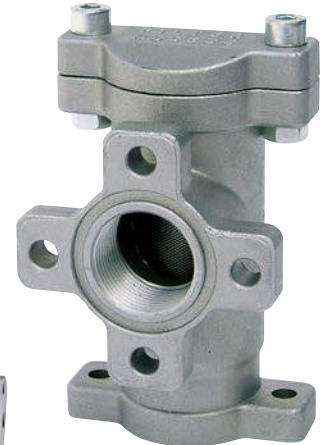
LINE FILTER 1-1