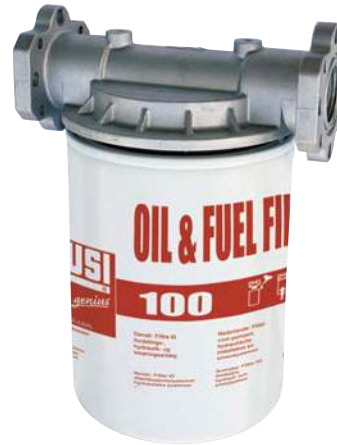
OIL AND FUEL FILTER